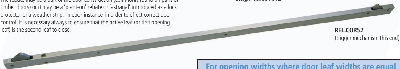
REL.COR52 (trigger mechanism this end)